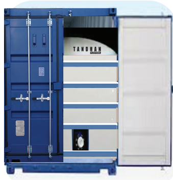
BOTTOM LOAD BOTTOM DISCHARGE