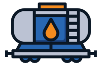
Bulk Liquid Transport & Logistics Industries