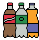
Food & Beverage Industries