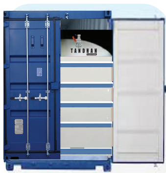
TOP LOAD TOP DISCHARGE

Technologically Advanced, Neatly Developed, High Agility for your Needs