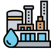
Petrochemical & Lubricant Industries