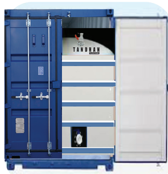
TOP LOAD BOTTOM DISCHARGE